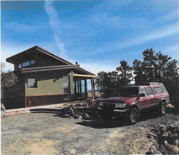
PARKING SPACES 1 (WHERE TRUCK IS PARKED) AND 2 (TO LEFT OF TRUCK)