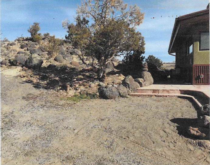
PARKING SPACE 2