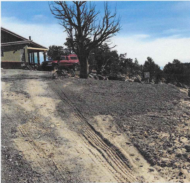
PARKING SPACE 3 (TWO VIEWS)